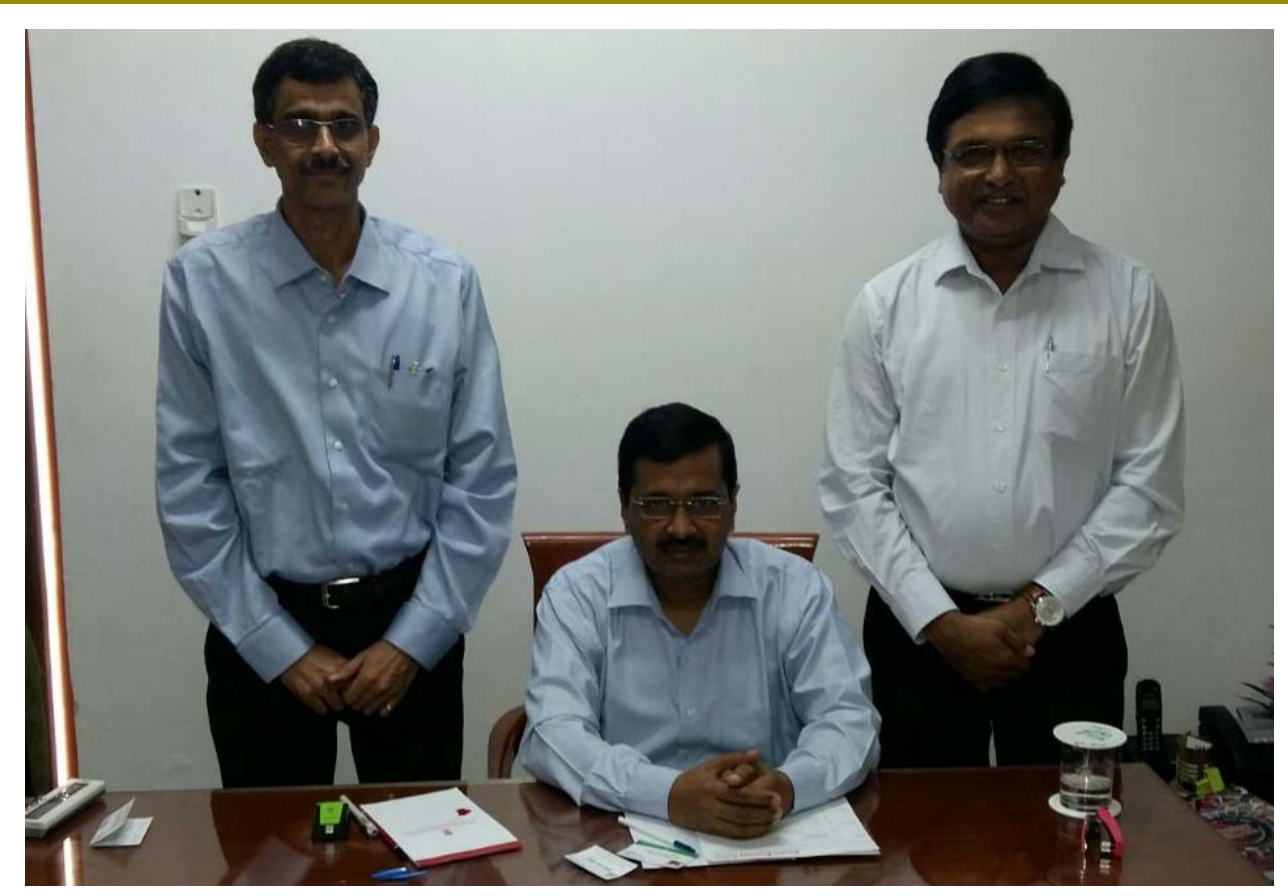
Meeting with Shri Arvind Kejriwal, Hon'ble Chief Minister of Delhi