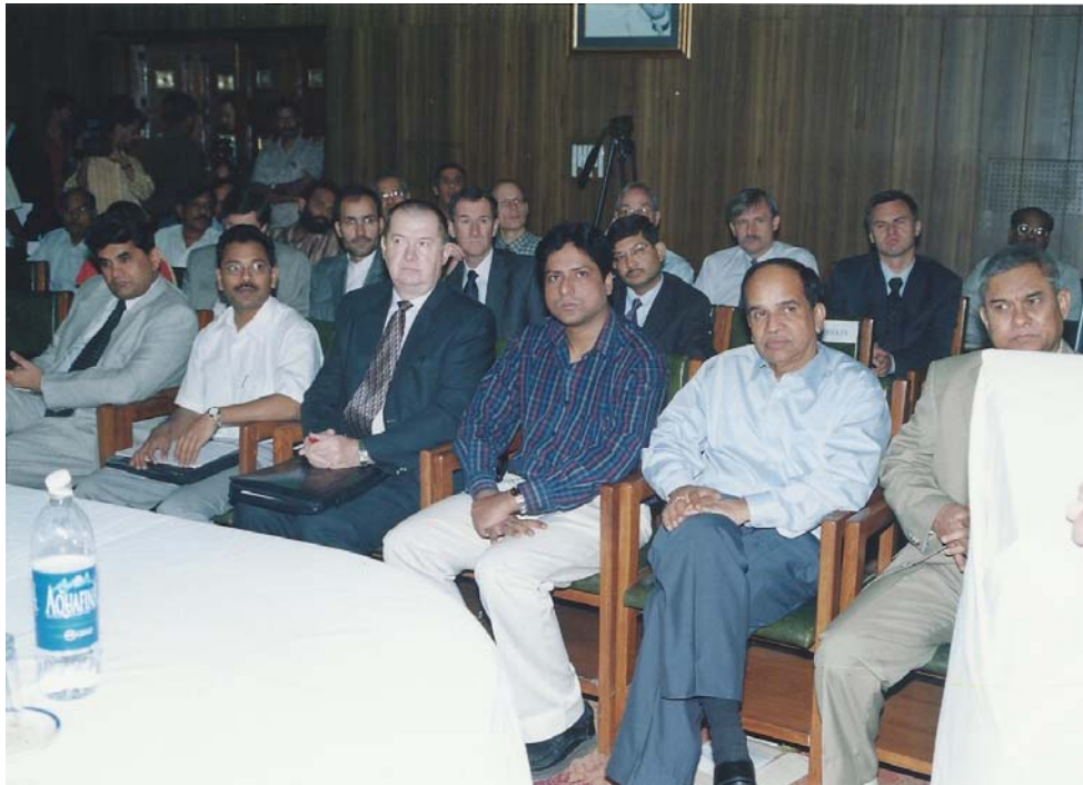
A view of participants at International State-promotional Programme