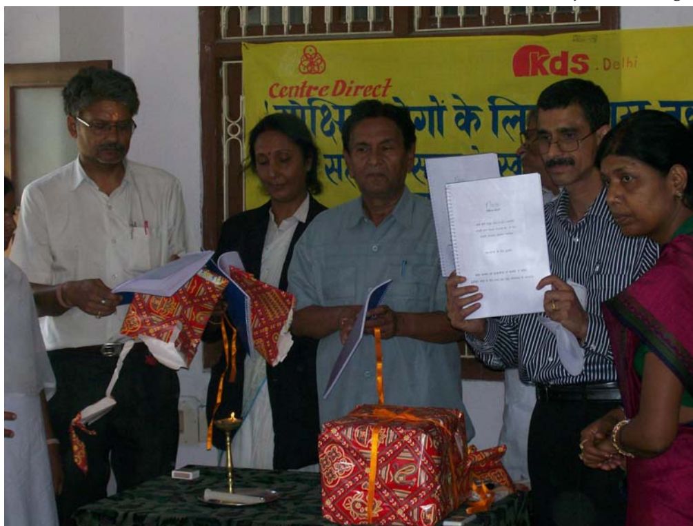
Releasing of a booklet for SHG-based Legal Volunteers (SLVs) at Nalanda

This project is in collaboration with Department of Justice , Ministry of Law and Justice, Government of India, and UNDP. A total of eight Legal Literacy Training Programmes were organized for SHG members in Muzaffarpur and Nalanda districts of Bihar and Karauli and Tonk districts of Rajasthan. Legal