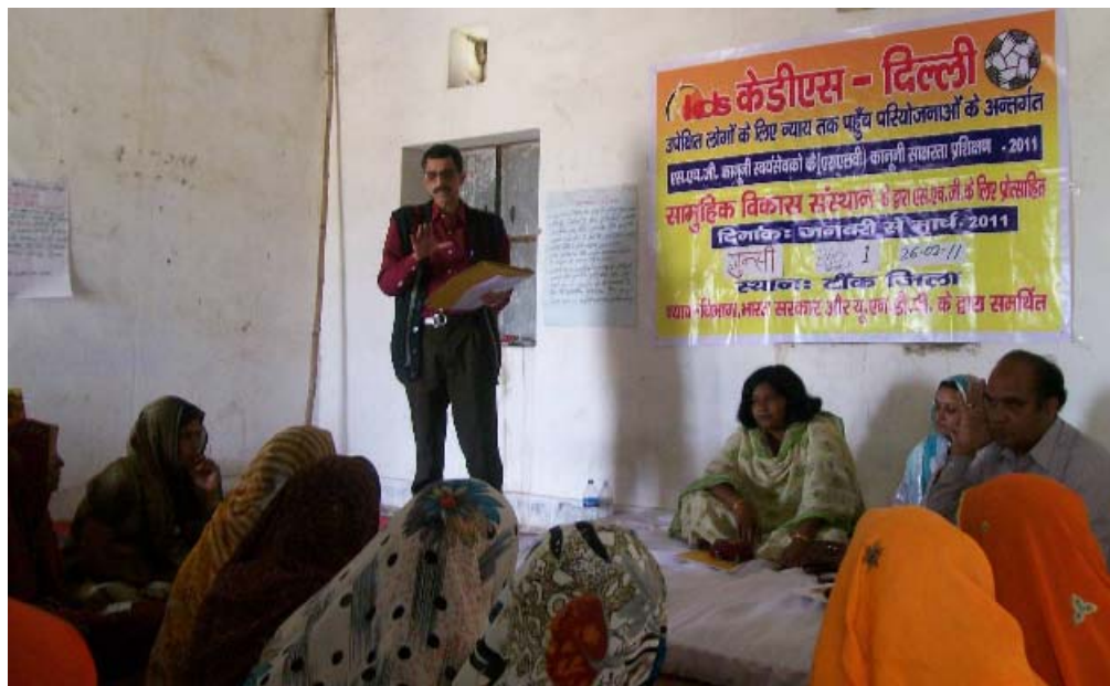
A view of training programme by SHG trainers, Tonk, Rajasthan