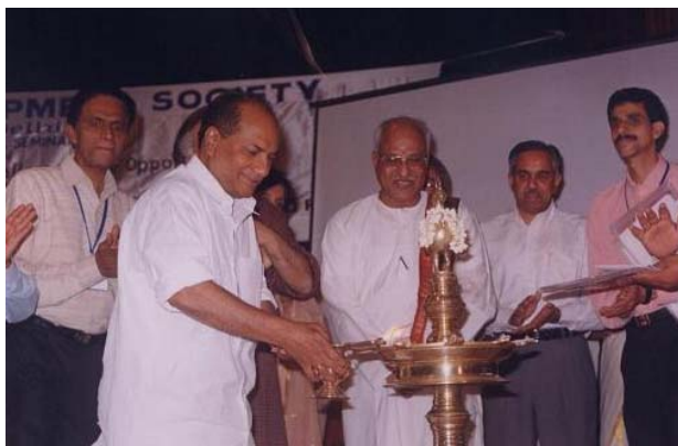
Shri A.K. Antony, Chief Minister of Kerala and Shri O. Rajagopal, Minister of State for Defence Production & Supplies, Government of India, lighting the lamp at the KDS inaugural function on 14 May 2003