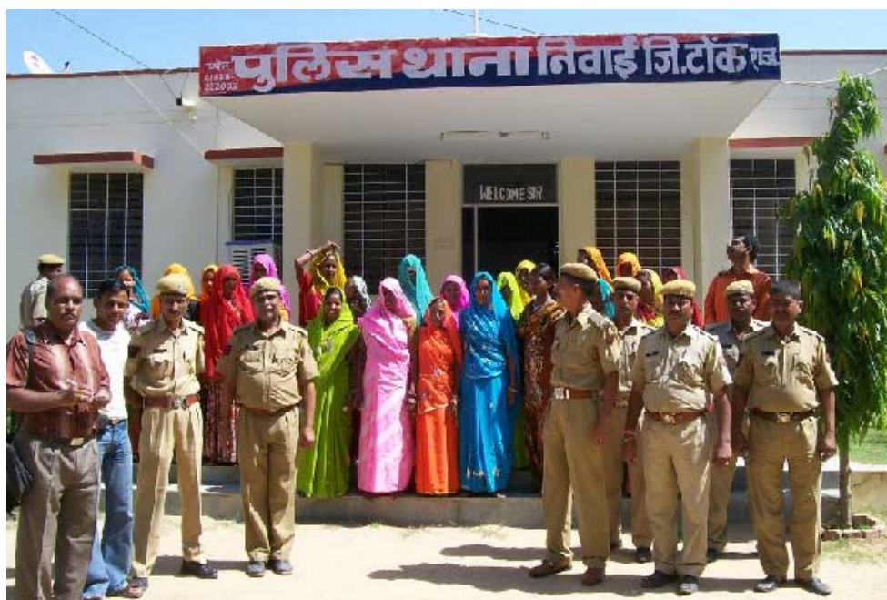
Visit to police station: Newai, Tonk, Rajasthan