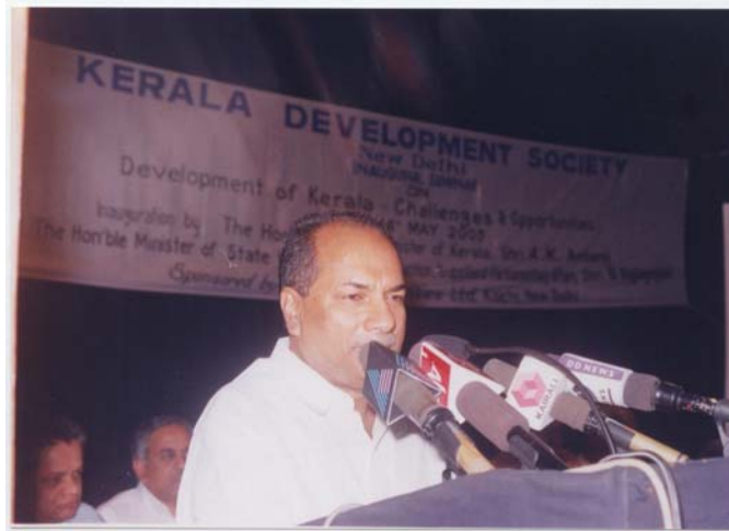
Shri A.K. Antony delivering the inaugural address

Political luminaries like Shri O. Rajagopal, Shri A.K. Antony and Shri Jaikumar Ramesh addressed the seminar at which a number of eminent economists and researchers from different parts of India participated and research papers covering macro-perspectives as well as sectoral aspects of Kerala’s economy were