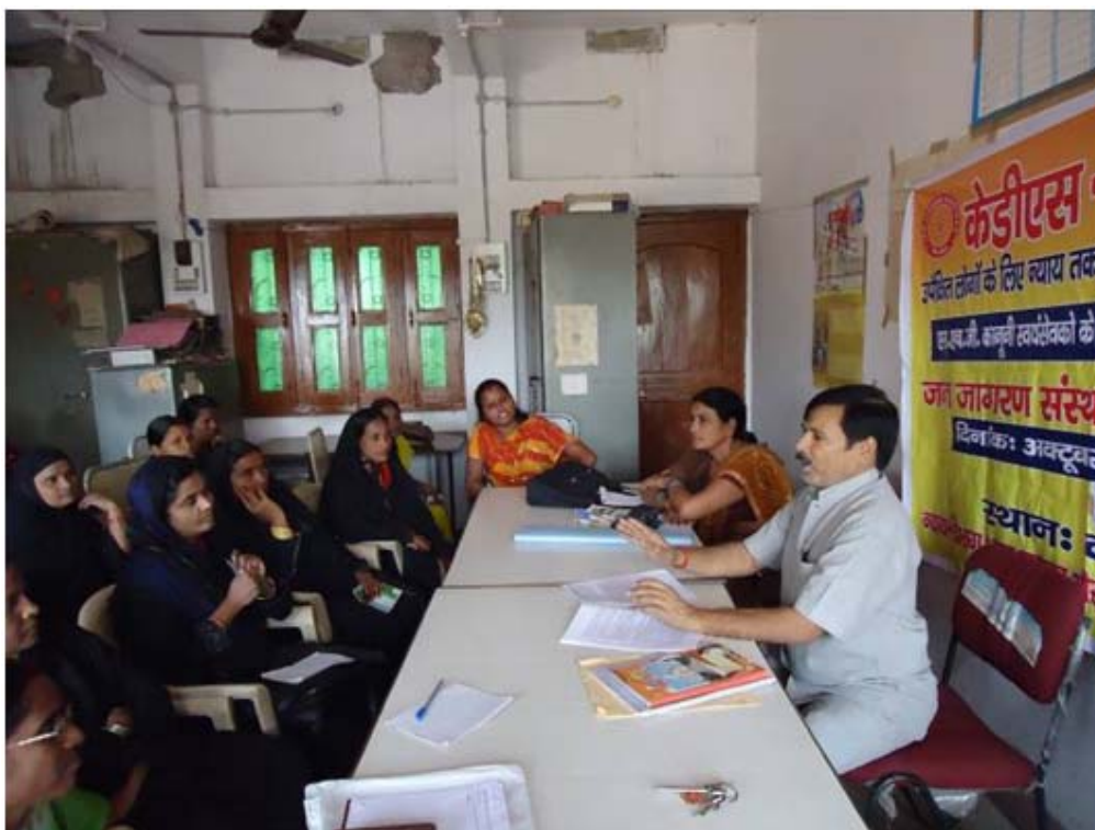
SHG Para-legal Training Programme in Nalanda