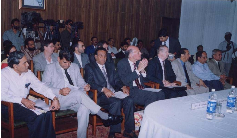
Diplomats participating in the discussion