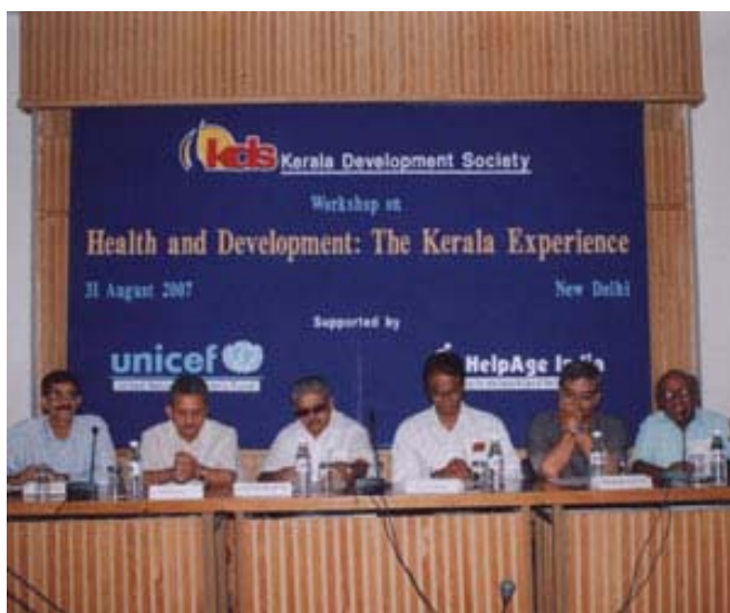
Shri Vayalar Ravi, Union Minister, (3rd from left), inaugurating the workshop on 'Health and Development'

In the light of the outbreak of chikungunya and other debilitating fever, universally acclaimed achievements of Kerala in the health sector are facing