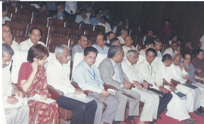
Another view of speakers and participants in the Seminar on "Development of Kerala: Challenges and Opportunities"