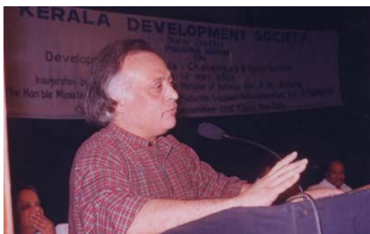
Shri Jairam Ramesh, currently Hon'ble Union Minister for Rural Development addressing the gathering at the inaugural session