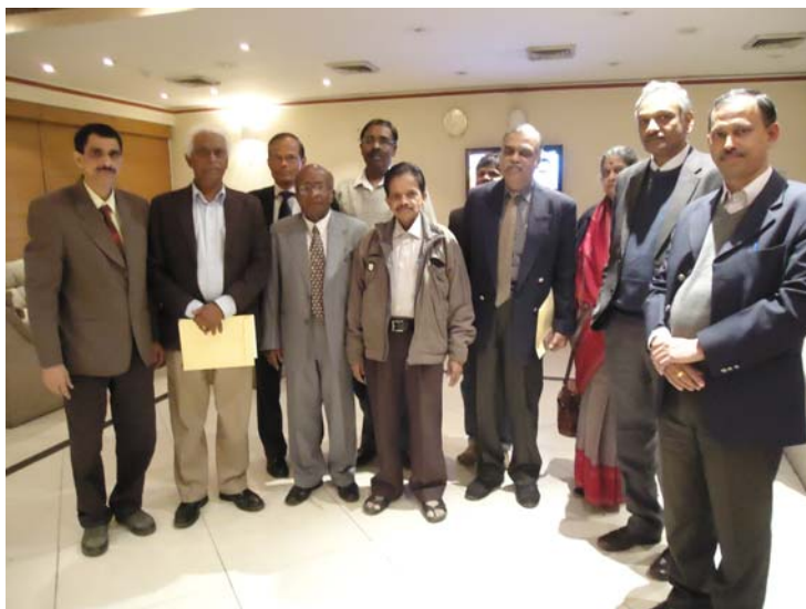
Quorum of a Governing Body Meeting