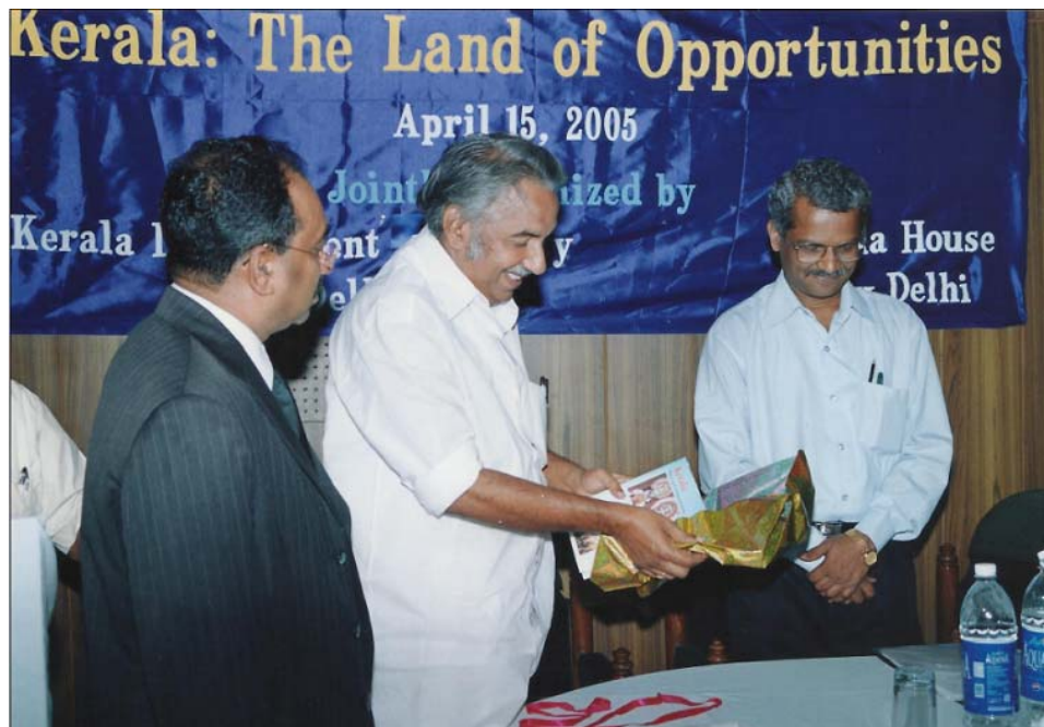
Shri Oommen Chandy, Chief Minister of Kerala, releasing the book "Kerala: The Land of Opportunities"

An international promotional programme for the State of Kerala was organized in Delhi on 15 April 2005. KDS and the office of Resident Commissioner in New Delhi, Government of Kerala, jointly organized the programme and Mr. Oommen Chandy, Chief Minister of Kerala, inaugurated it. The economic opportunities for the potential as well as existing investors in different sectors were highlighted in this programme which was attended by Ambassadors/Commercial Counselors of 15 different countries, including Canada, Chile, France, New Zealand, Poland, Sri Lanka, Serbia and Montenegro, Slovenia, and The Netherlands. Presentations on potential sectors were made and specific investment proposals were deliberated.