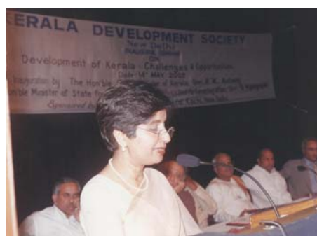
Mrs. Nirupama Rao, currently Ambassador to the United States of America addressing the gathering at the inaugural session