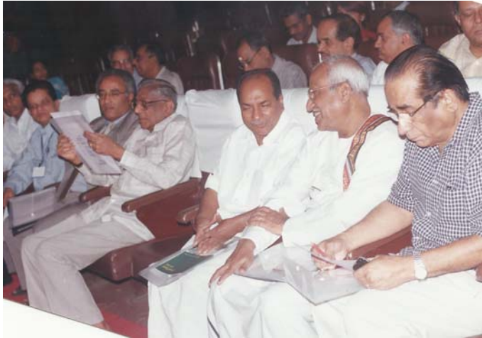
A view of speakers and participants in the seminar on "Development of Kerala: Challenges and Opportunities"

achieved. A cyclonic change in the mindset has to take place to move away from being the prisoners of the past in terms of attitudes, particularly towards private investments and private initiatives. The main findings of the seminar were sent to the concerned departments of the Government of India and of Kerala.