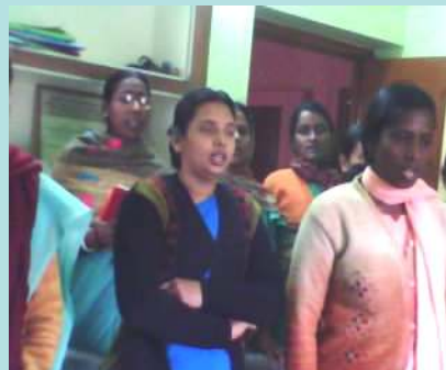
Women SHG leaders interact with KDS District Plan teams at Bishnupur, Bankura, The meeting organised by Friends of Poor and Society Abandoned (FPSA), Bishnupur.

Bankura District, West Bengal: KDS signed MOU with Assistant District Magistrate, Bankura District on 05 January 2012 for the preparation of District plan of Bankura District.